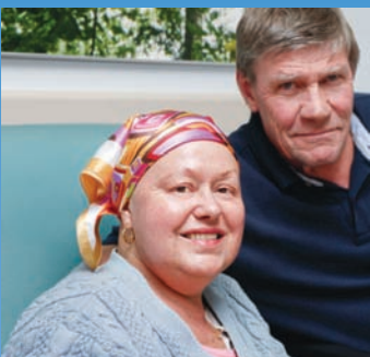
raising funds for patient care and cancer research on June 27.