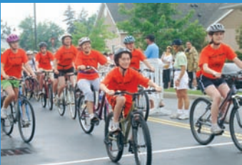
and more than 424 teams and 407 Extra Mile Club members...