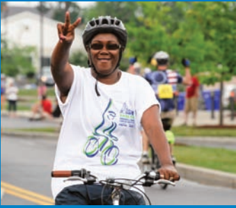
6,500 cyclists, 1,000 volunteers...