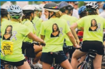
families and friends of patients...